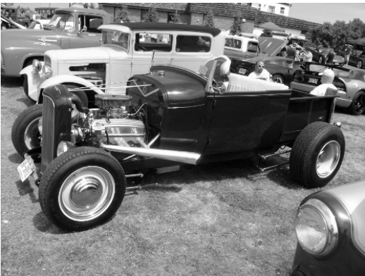
The 5th Annual Hot Rods for Hospice was held on August 6, 2011 at 8 Ball Billiards Café in Plattsburgh. We had a great turnout and approximately seventy cars registered!