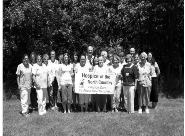
Pictured above are HONC staff members at a staff development day.