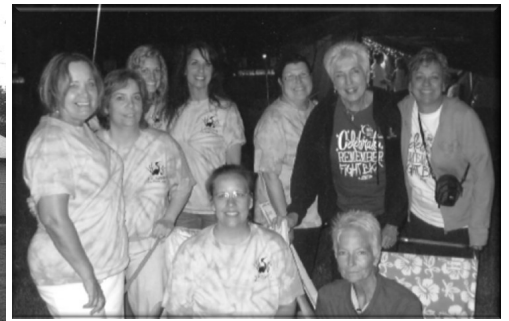
HONC Staff Members from both Clinton County and Franklin County participated in the American Cancer Society's Relay for Life 2011 held on June 17th in Malone and Plattsburgh.